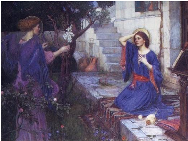
John William Waterhouse: The Annunciation, 1914

Contemplando constantemente a María es posible vivir los consejos evangélicos estrechamente anclados a su ejemplo. La virtud de la docilidad, según el ejemplo y el pensamiento del Padre Kolbe, ayuda a practicar una vida religiosa santa porque a Ella le fue conferida una mirada sobrenatural y vivir los votos se convierte en una consecuencia de esta visión de la propia existencia. Esta virtud ayuda a organizar en armonía la vida fraterna, visto que el estilo humilde hace posible superar las divisiones y discordias así como también ensanchar la mirada y elevar nuestras metas hacia lo alto.