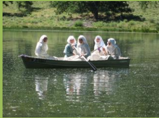
Norbertine Sisters, Tehacapi, CA