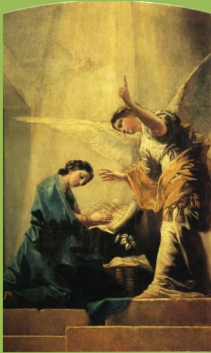
The Anunciation Francisco Goya, 1785